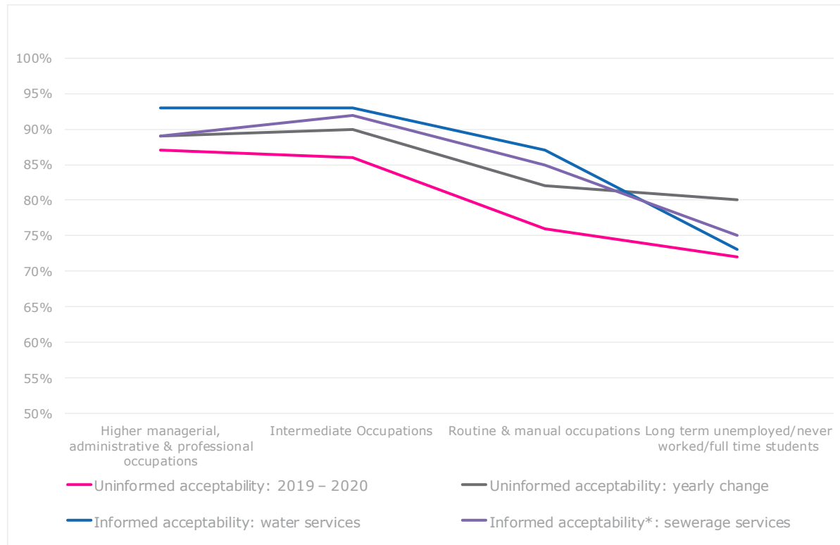
Fig2: Uninformed acceptability, 2019-20 and yearly change, and informed acceptability for water and sewerage charges:

Uninformed acceptability for the change from 2019 to 2020 is lowest among the long term unemployed / never worked / full time students and those in intermediate occupations. When looking at water services (at the informed level), those in higher managerial, administrative and professional occupations and intermediate occupations are significantly more likely to find the proposed bills acceptable than those who are long term unemployed / never worked / students.