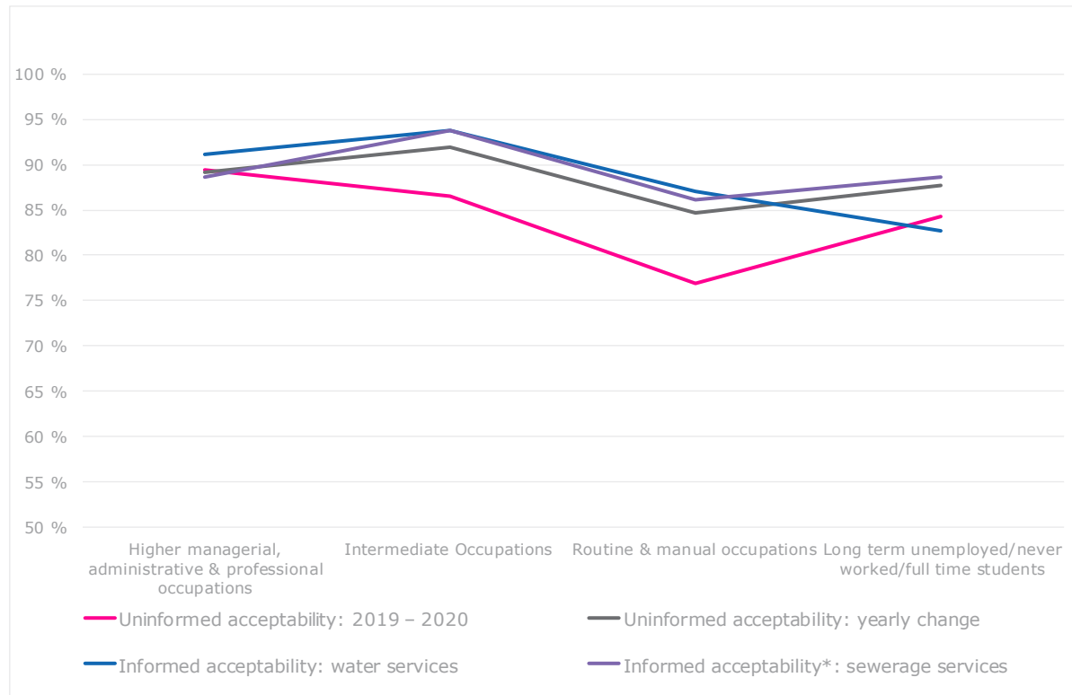
Fig2: Uninformed acceptability, 2019-20 and yearly change, and informed acceptability for water and sewerage charges:

Routine and manual work and those who are unemployed / never worked / full time students are least likely to accept proposed bill changes. When looking at uninformed acceptability from 2019-2020, those in higher managerial, administrative and professional occupations are significantly more likely to find the proposed bills acceptable than those in routine and manual occupations.